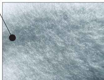
Unique Polyester (PET) Felt